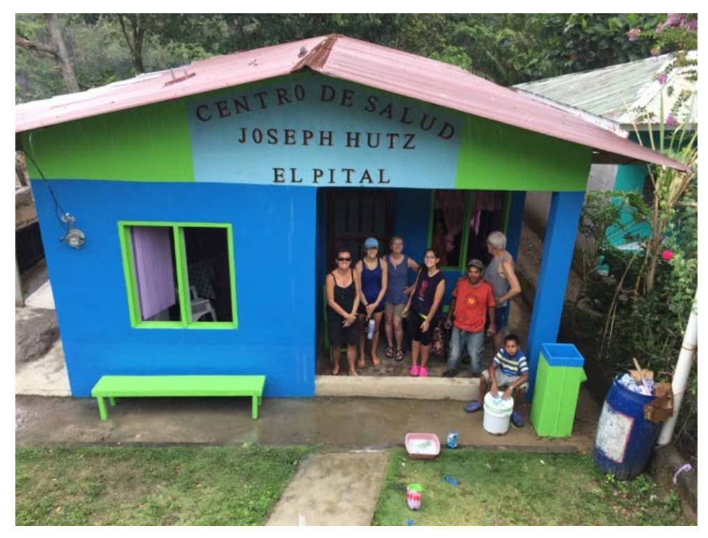
El Pital Clinic

Tickets are $20 ($15 for students). There will be six people per trivia team. Tickets can be